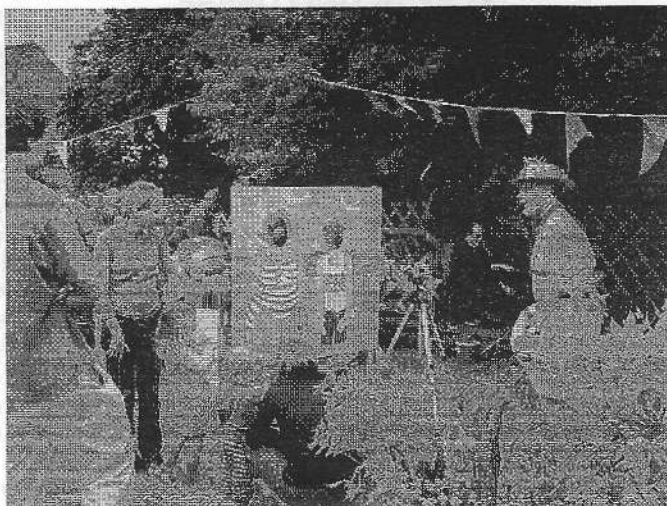
All the fun of the seaside in Great Hinton